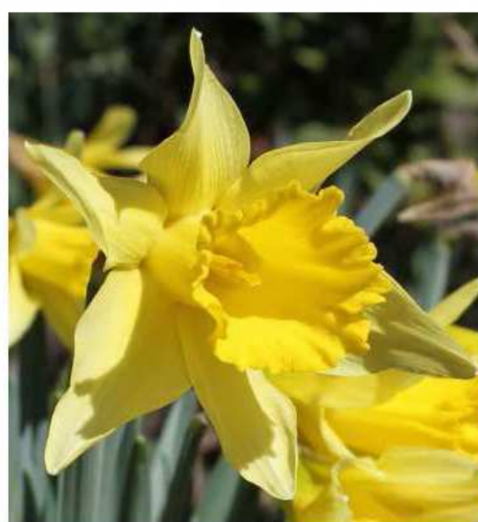
(a) Typical form

NARCISSUS (Figs. 1a & 2). Roadsides, fields, pastures, lawns, open woods, old home sites; throughout Alabama; common; February–March. This species is a native of Europe and is the most widely naturalized species in North America. It has escaped cultivation in the eastern half of the USA and also occurs in West Coast states (BONAP 2013). Narcissus pseudonarcissus is identified by its solitary flowers with a corona as long as or longer than the tepals. Double forms are often confused with double-flowered N. ×incomparabilis , but the tepals of N. pseudonarcissus are almost as long as the corona segments. [FL, GA, MS, TN]